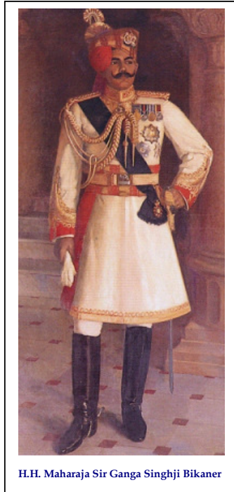
H.H. Maharaja Sir Ganga Singhji Bikaner

Maharaja Ganga Singhji Trust was created by Late Maharaja Dr. Karni Singhji of Bikaner in 1972 for public charitable and philanthropic purposes, to promote the development of the former Bikaner State with a view to promote cultural, educational, medical, and sports facilities.