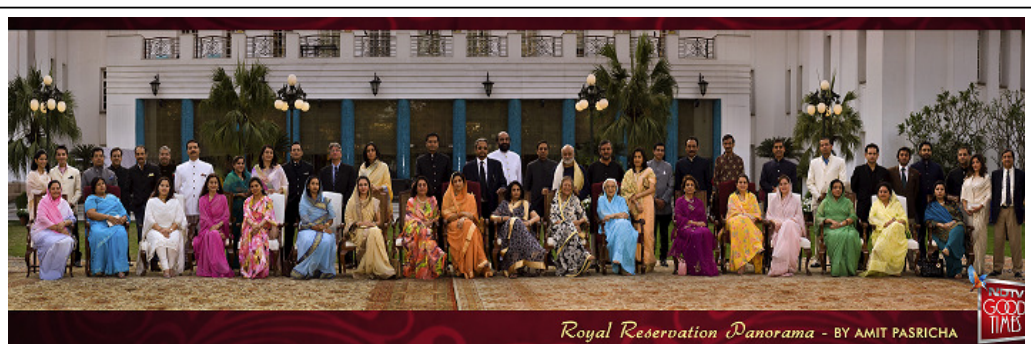
Royal Reservation Panorama

In March 2010 the NDTV Good Times hosted a Royal Evening to mark the success of its extremely popular travel series “ Royal Reservation ” at The Imperial Hotel, New Delhi. Surrounded by photographs and memorabilia of their ancestors who attended the Delhi Durbar in the year 1911, families from across Princely India gathered for a portrait session. It was indeed quite an event and was a huge achievement to gather together so many members of the Indian Princely families. An arresting group photograph was taken in the lawns of the Imperial.